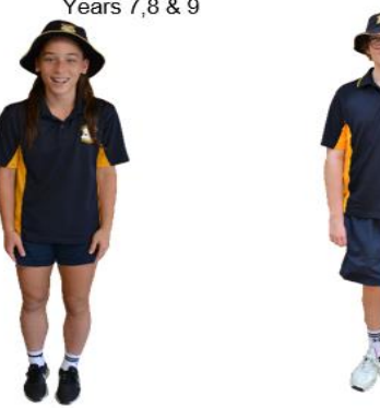
with optional skirt