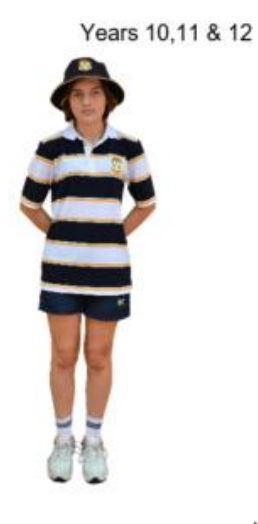
with optional skirt